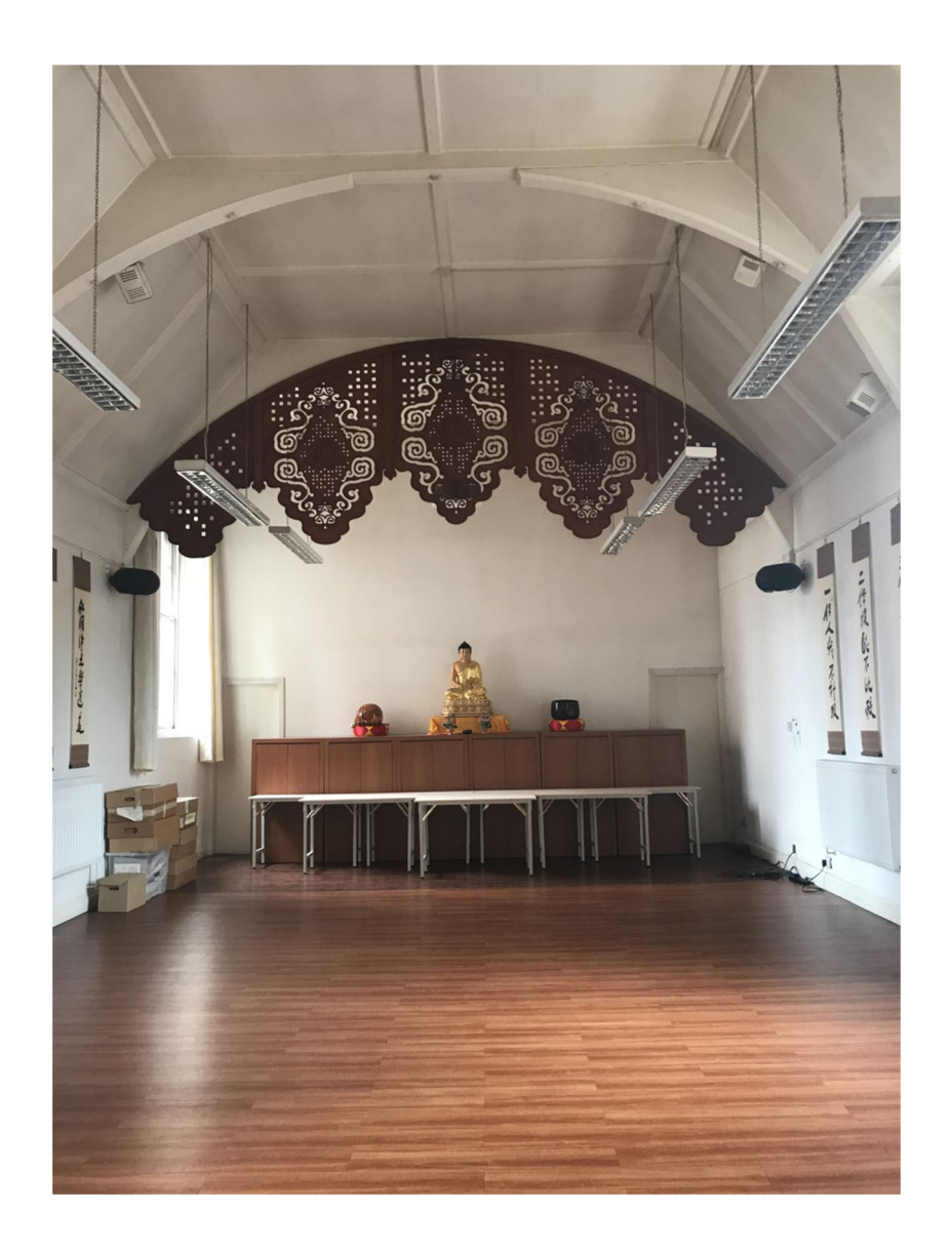
Figure 3 Upper floor room (Photograph by Author).

school space. However, looking after this building is replete with challenges, including issues with the roof and ongoing maintenance that needs to be completed in line with the legal requirements for listed buildings. Following a competitive application, in 2016 FGS London were the first temple to be awarded Heritage Lottery Funding (Grants for Places of Worship Scheme) of £209,300 (allocated in two parts) to support the repairs, the first part of which had been completed when I conducted interviews, and the second part was in the planning stage. <sup>60</sup>