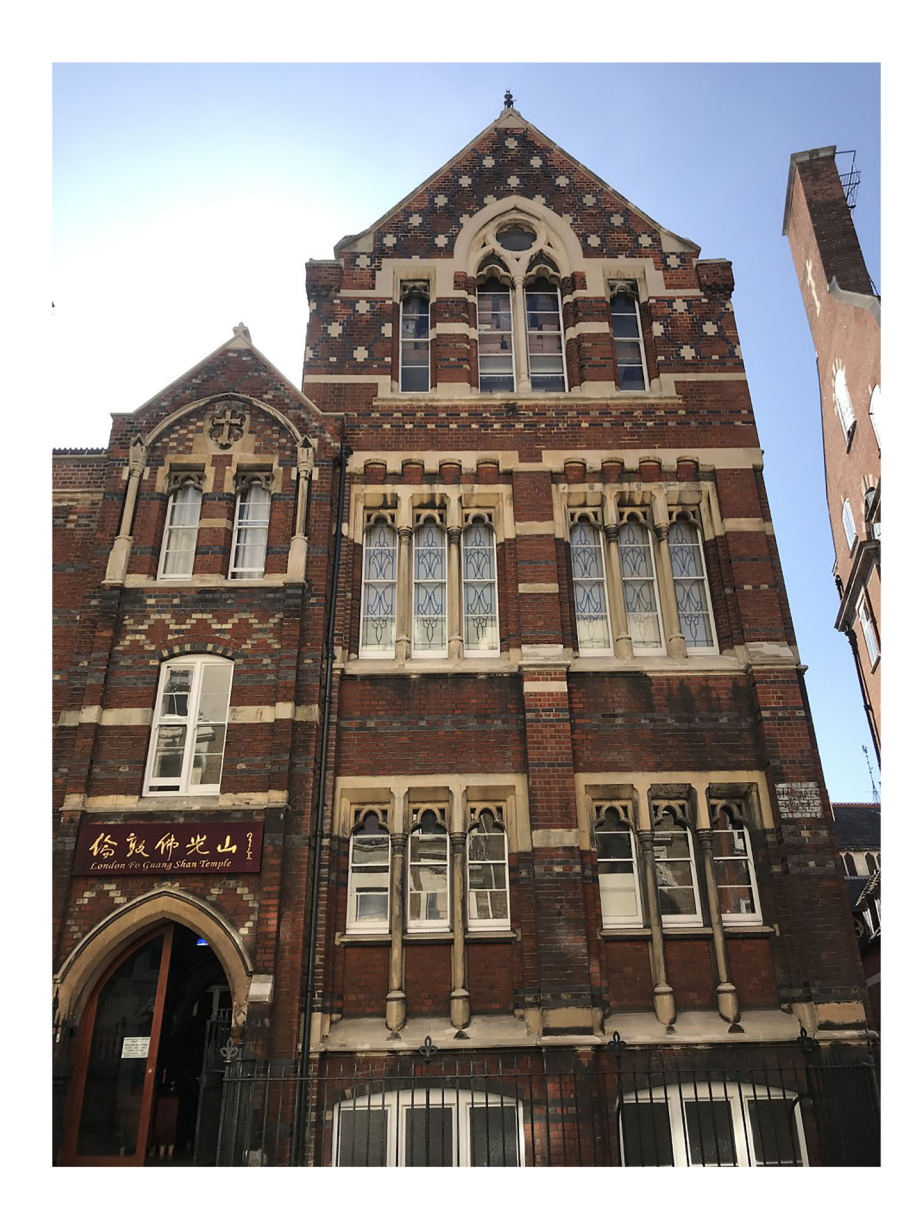
Figure 1 Front of London Fo Guang Shan Temple, Margaret Street (Photograph by Author).

the Brick, Wally the Wok and Steve the Stairs) showing viewers around the temple and giving a potted history of the space and its current usage. As the YouTube video tour promotes proudly, FGS London has the largest number of Buddha and bodhisattva images of all the temples in Europe. The manner in which the YouTube video is presented, as well as its content, is one aspect of the "localization" of FGS practice to the British cultural scene. The video tour incorporates a classical music score that might traditionally be associated with England, such as the hymn, Thine be the Glory, and Rule Britannia, as well as cartoon imagery of the London skyline behind the temple building. It is unclear exactly who this video tour is aimed at, but it is likely to be potential new devotees or the