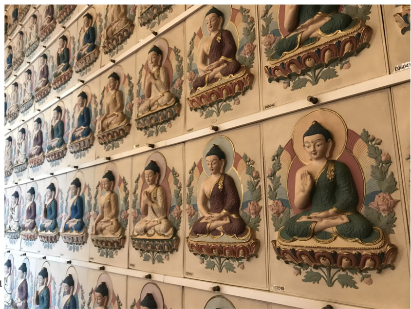
Figure 4 Buddha and Bodhisattva wall bas-relief (Photograph by Author).

FGS London's diverse activities stretch beyond the boundaries of the temple and they also host public ceremonies in Leicester Square, such as celebrating the Buddha's Birthday with local public dignitaries. As part of environmental charitable work, London Fo Guang Shan arranged for 4,500 trees to be planted in Theydon Bois Forest (Essex), and they have also participated in official Heritage Open Days, where members of the public can attend the temple for meditation and vegetarian cooking demonstrations, as well as sutra writing. <sup>64</sup> This public-facing activity, using both the temple space and wider surroundings, is a further attempt