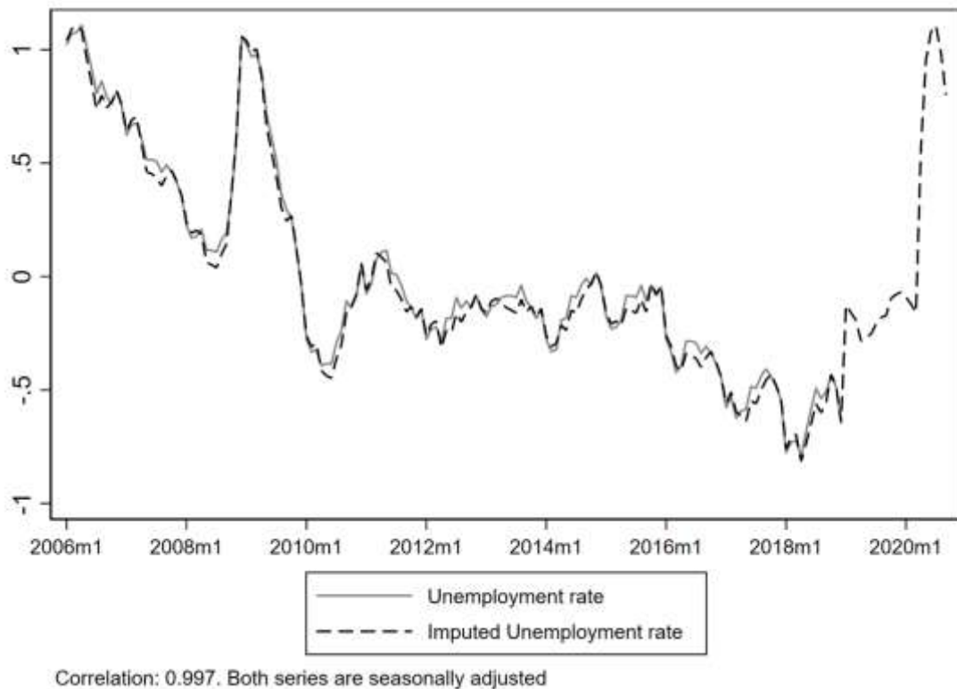
Figure 2. Unemployment statistics

Notes: This figure shows the time series of the official unemployment rate (the solid grey line) and the imputed unemployment rate (the dashed black line) over the 2006 – 2020 period. All series are seasonally adjusted.