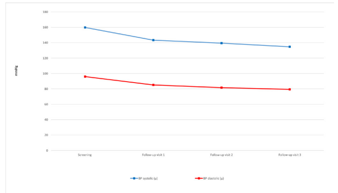
Figure 2 Trends in blood pressure (BP) change among patients with hypertension (n=428).

The mHealth training was stated to be a valuable experience. Participants were very appreciative of the knowledge they acquired about prevention and control of NCDs.