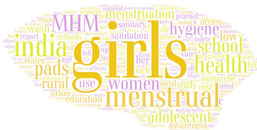
Fig. 2. Wordcloud representing a semantic analysis of 57 online sources addressing menstrual hygiene management in India.

Since she had been living in the slum for the last fifteen years, we questioned her about the views of the younger generation of women in the slums towards the use of sanitary napkins and whether they would