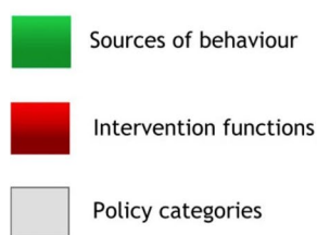
Fig. 1 Behaviour Change Wheel reproduced from Michie, van Stralen and West (2011) [16]

This cross-sectional survey aimed to expand on this initial scoping correspondence to provide data on provision of PBM, current practices and barriers and facilitators to implementation of this recommended therapy.