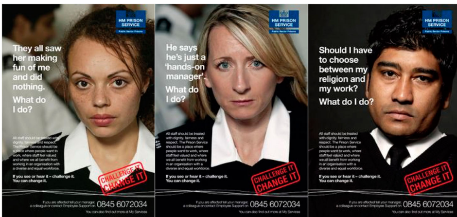
Figure 1. Posters from the Challenge It, Change It campaign at Hillside.