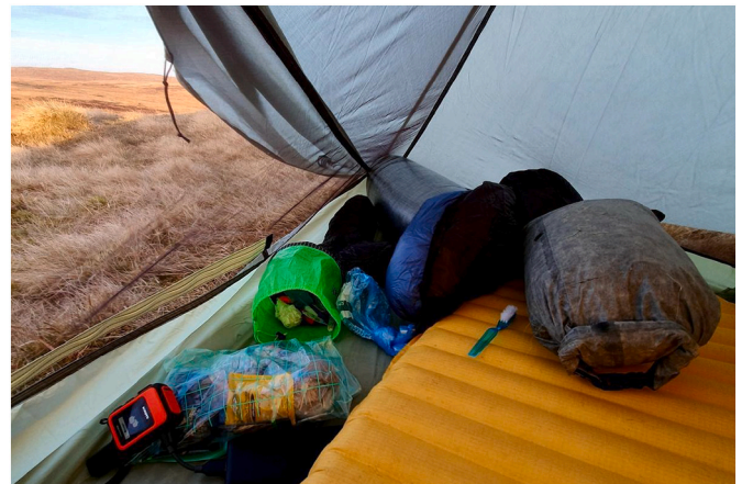
Fig. 2. Garmin inReach at a wildcamp location, TGO, Scotland.

mobile device uses, but rather to assess route planning and to better understand situational uses. The aim was to understand both in a broad sense how participants planned routes, how specific incidents of use unfolded on the TGO, and what contingencies were brought to bear in the context of use; for example, technical problems, GPS issues, environmental issues, social influences, and so forth. What was not originally anticipated, however, was that this data collection method would also provide the study with useful insights into how the research methods affected the participants' experience of the TGO and their in-context feelings towards what they had been asked to do.