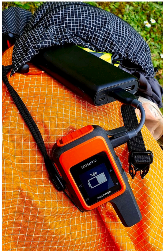
Fig. 5. The Garmin inReach of P08 attached to a battery pack for recharging near Fort Augustus, Scotland.

The participant profile could have been more diverse and perhaps reflected wider opinion; for example, there was only one female among eight TGO participants. The recruitment process started several months prior to the event, and participants were selected based on their intention to participate in the TGO and their indicated use of technology when backpacking. Efforts to have a more balanced participant profile were unsuccessful.