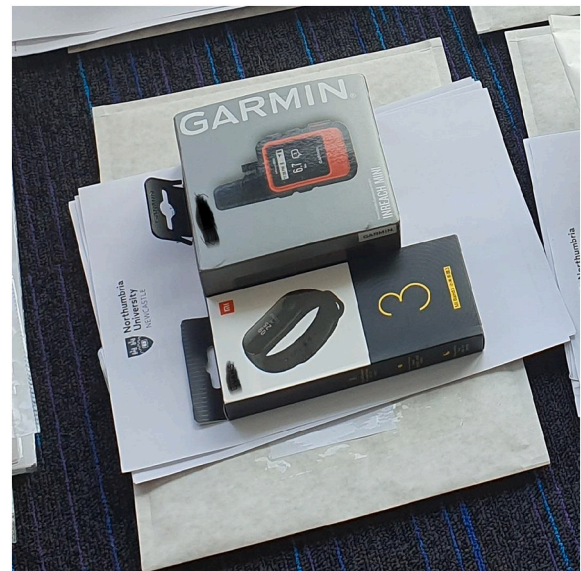
Fig. 1. Research participant pack sent by mail ahead of the TGO with: a Garmin inReach (Fig. 2), a MiFit smartwatch, a detailed 10-page instruction guide, and a laminated pocket card explaining how to set up the devices and detailing what needed to be done each day (photograph by P. Innocenti).

The analysis of this recorded data grows out of the participants' planning activities each morning, followed by a reflection on those plans in the evening. The goal was not to provide a statistical breakdown of