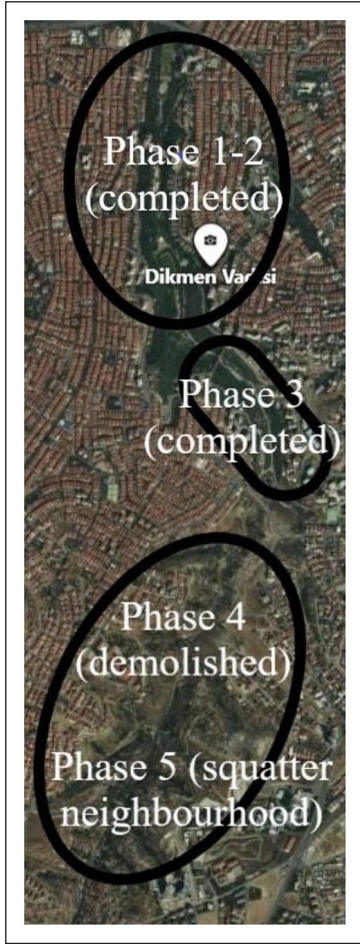
Figure 1. Dikmen Valley urban redevelopment and housing project area as phases.

and Özdemir, 2006: 8). The housing and urban redevelopment project started in 1989 proposing a relocation model based on self-financing. The new luxurious housing units were marketed, and the money was used to resettle squatter dwellers in affordable apartments in the area (Uzun, 2005: 188). The project was planned to be implemented in five stages (see Figure 1). It targeted integrating the former squatter dwellers resettled in the east and the upper-income groups in the west by connecting them with a two-storey bridge hosting social and commercial facilities such as a cinema, retailers and cafes (Eren, 2016: 67). The first two stages were in accordance with the original plan, and squatter dwellers