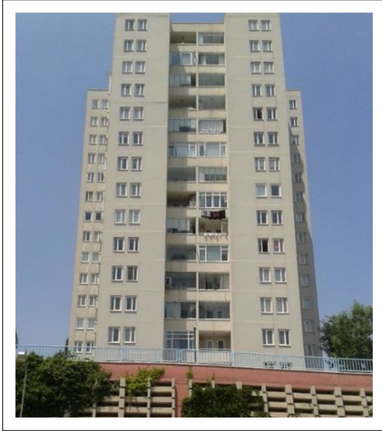
Figure 2. This building was constructed to resettle the former squatter dwellers in the third phase of the project area. Note the laundry hanging from two balconies. Source: Author, 18 June 2014.

space, as shown by the citation by Berkay, an owner-occupier in a prestigious gated estate: