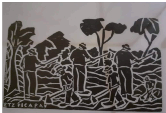
Fig. 3. Artwork depicting local sugarcane harvest (woodcutting by Enéias Tavares dos Santos), Théo Brandão Museum, Maceió, Alagoas.

Eucalyptus cultivation as feedstock is also under consideration in São Miguel (workshop, UFAL, Sept 2019). Eucalyptus in Brazil,