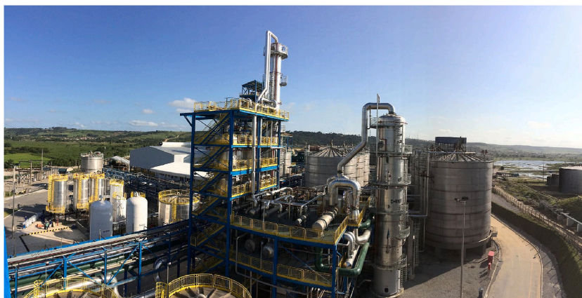
Fig. 2. GranBio's Bioflex 1 plant, São Miguel dos Campos, Alagoas.

required return. 5 The remaining bagasse is incinerated to generate electricity for use in the biorefinery (Granbio, 2020). Granbio does not intend to open additional biorefineries and plans to focus on developing and marketing new biomass technologies.