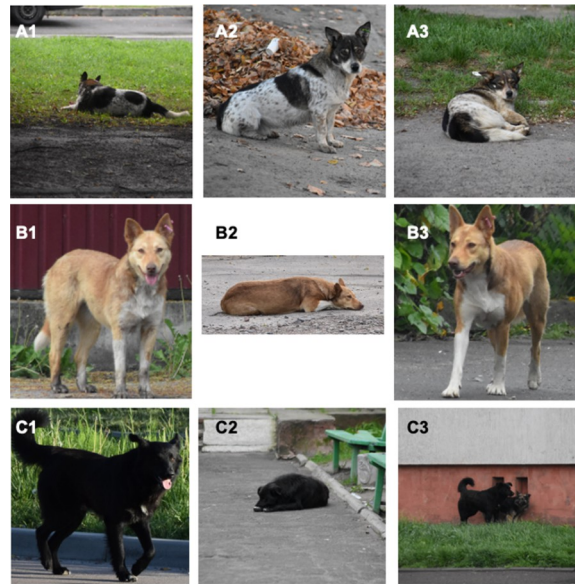
Fig 3. Examples of distinctiveness ratings of dogs identified across primary sampling periods: A1-3 of distinctiveness 1 (distinct with unique markings); B1-3 of distinctiveness 2 (moderately distinct, with some identifiable colouring/markings); and C1-3 of distinctiveness 3 (indistinct, mono-coloured, minimal markings).

https://doi.org/10.1371/journal.pone.0266636.g003