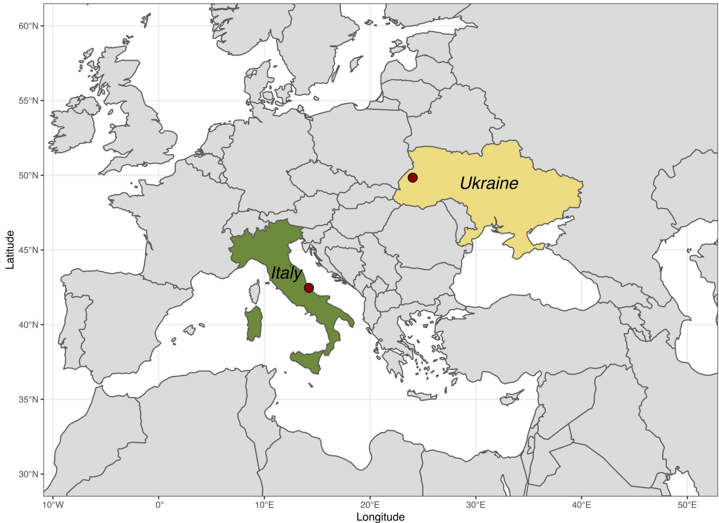
Fig 1. Map highlighting Italy (green) and Ukraine (yellow) with study regions of Pescara and Lviv indicated by red circle.

https://doi.org/10.1371/journal.pone.0266636.g001