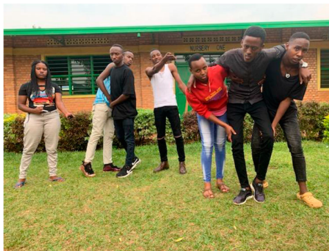
Figure 1. Image theatre of Nkore Iki? (What can I do?).

A key critique levelled at participatory processes, particularly as adopted within policy and programming development, is that these processes can be seen as 'tick box' exercises; something which is important to be seen to be done, rather than an opportunity to truly learn (Tisdall 2015). This dilutes the transformational potential of participatory approaches to enable the creation of new knowledge and practices and to challenge normative assumptions and power relations (Gallacher and Gallagher 2008). In terms of adultism, traditional adult-child power relations position the adult as the expert, the child as the learner and unless these are negotiated, challenged and reworked, these relations of power act as a barrier to the participation of children, since children will be seen (and may act) as present to listen and learn, not express and share. Within MAP we have found that performance has been an effective tool to create a space for dialogue between young people and adults, given the ways in which the model challenges traditional power dynamics, with the children and young people serving as actors and so the audience