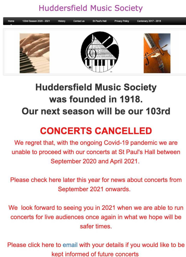
Figure 2: Concert cancellation notice on the Huddersfield Music Society homepage ( http://www.huddersfield-music-society.org.uk/ ).

The past twelve to eighteen months have blurred the concept of live performance, the very foundation of the planned commemorative activity for these societies and, indeed, the backbone of the