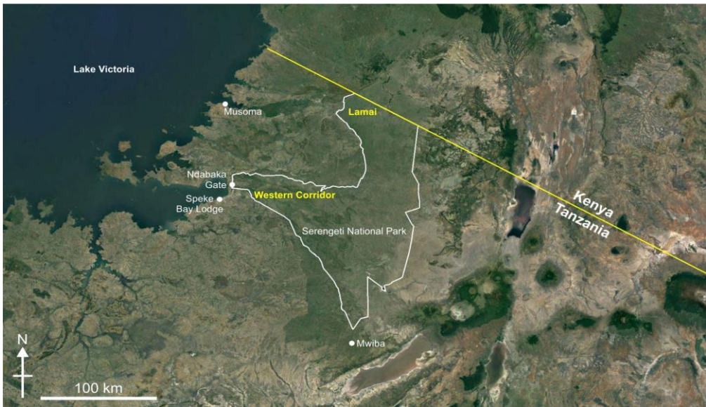
Figure 1: Map showing the study area. Locations mentioned in the text (white font), Serengeti National Park (white outline, Source: UNEP-WCMC and IUCN 2022) and the two regions where dust devils with high charcoal loads were observed during fieldwork (yellow font). Meteorological data were available from stations at Musoma (Meteorological Station GSOD ID 637330-99999, WMO ID 63733; location -1.500, 33.800 ; 1147 m asl) and Speke Bay Lodge (privately operated; location -2.267, 33.796 ; \sim 1140 m asl). Basemap imagery has been adapted from Google Earth, 2022. http://earth.google.com/web/ (multiple imagery acquisition dates in mosaic).