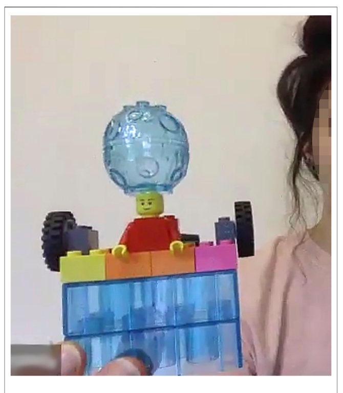
FIGURE 2 | The "big brain".

Because the second main question focused on tasks, this also included ways a robot could learn about the user's actual needs to