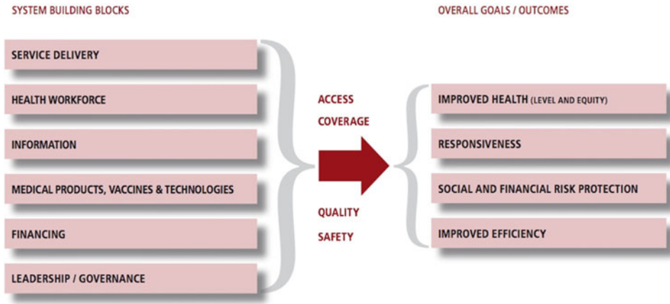
Figure 1. WHO health system framework.

interpretation of legal texts, we evaluate what the TCA, the WA and the provisions of the CTA mean for the NHS and social care across the UK. We draw on documentary data in the public domain, 23 semi-structured interviews and two online workshops, carried out under two related research projects, from February 2019 to December 2020. Ethical approval was given by the University of Sheffield (Reference 022929) and the University of Oxford (Reference R72072/RE001) (Figure 1).