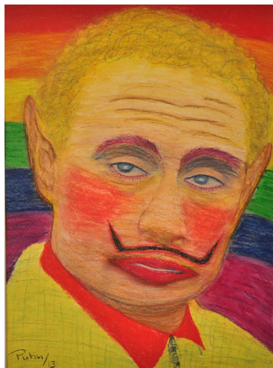
Figure 5 (R). Untitled by Anton ( putinarainbow.com )