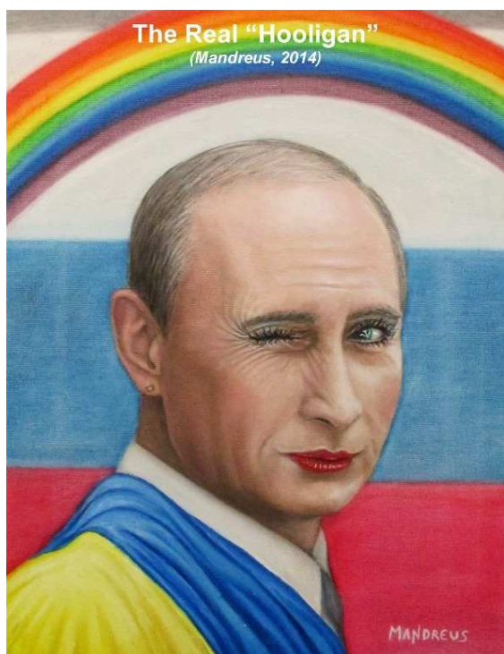
Figure 4 (L). 'The Real Hooligan' by Mandreus ( putinarainbow.com )