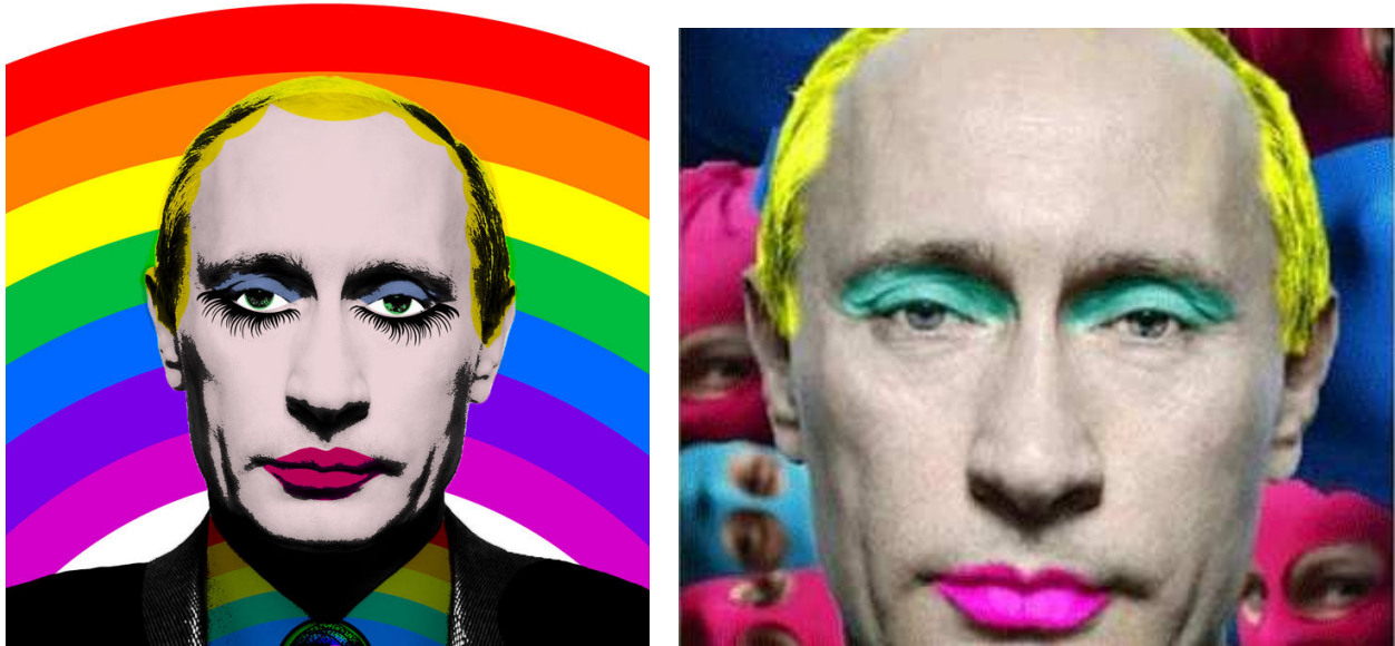
Figure 3 (R). Untitled – TheDavyStar (2017).

Photographs taken at worldwide protests against Russian homophobia since 2013 show how heavily GCP features over the years—mostly Figures 2 and 3. Searches in two international image databases—Getty Images and AP Images—for ‘Russia gay propaganda’ show how frequently these memes are used in political activism and how they have been used to protest the ongoing Chechen gay purge. Excluding non-protest images, 11.81% of Getty photographs (66/559) and 12.88% of AP photographs (17/132) included GCP. 5 Given the amount of subjects to photograph at protests and that they appear in Asia, Europe, and North America, this is indicative of the meme’s saliency. 6 Due to space constraints and image copyright it is impossible to show the full circulation and use of GCP in protests and media coverage about Russian homophobia.