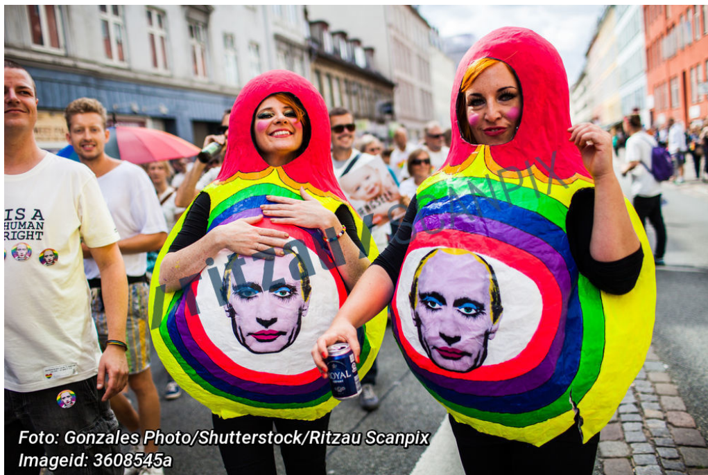
Imageid: 3608545a