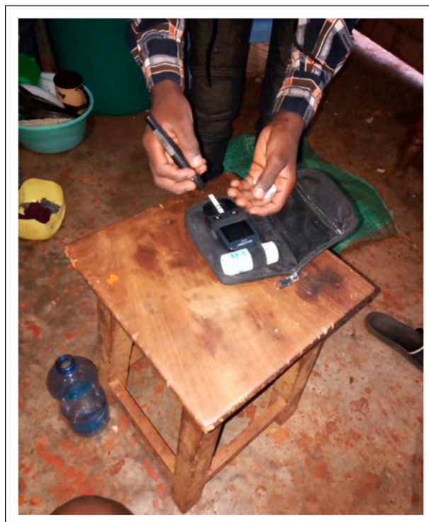
Figure 2. Preparing insulin for injection.

Another aspect of disease management where children were proud of demonstrating their independence was