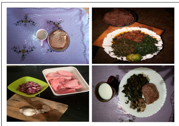
Figure 1. Photographs of meals and snacks.

almost every child participating did so, reflecting that this is a key concern in their day-to-day life. Children were proud of their ability to manage their diet independently and showed a high level of nutritional awareness. For example, knowing that brown rice is more nutritious than white rice, or reporting that they based meals on a guideline ratio of \frac{1}{4} protein, \frac{1}{4} carb, and \frac{1}{2} vegetable per plate. They were also aware of the impact on their blood sugar levels if they were forced to skip meals or snacks, such as in school.