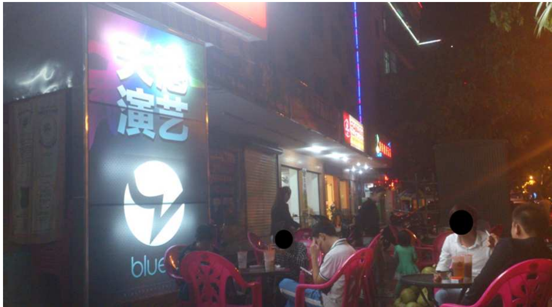
Figure 2. Blued sign outside Tianchi.

before the app became widely known and used, some men in Sanya believed that it was in fact the bar itself that was named 'Blued.' For Tianchi, a further benefit of this sign and its inclusion of Blued's logo was the way in which it tacitly announced the presence of a gay bar without the need for explicit terms to refer to sexuality. In the political and social climate of the PRC, and Hainan in particular, the use of terms such as 'gay,' 'tongzhi' or 'homosexual' in Tianchi's publicly visible signage could risk attracting unwanted attention from the general public and the authorities. It would also deter local non-heterosexual people from visiting the bar for fear of being seen entering. In this context, the illuminated logo of an app catering to men who desire men turned Tianchi into a visible non-heterosexual space while ensuring that it was visible as such only to those familiar with Blued.