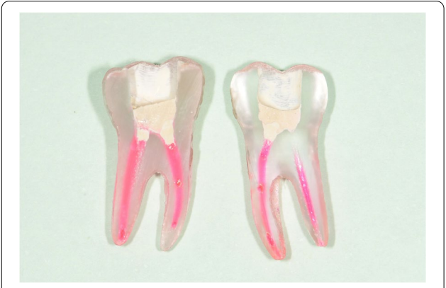
Fig. 1 Example of the sectioned Endo Reality 3D tooth showing FP

The participating GDPs' success in training will be determined using the FP training criteria below to evaluate both the FP procedure carried out on the 3D teeth and the post-operative radiographs taken of the 3D teeth. Formative assessment for the dentists will include self-assessment using a success checklist measuring success against the same criteria. Ultimately, the decision as to whether a dentist has been successfully trained in the