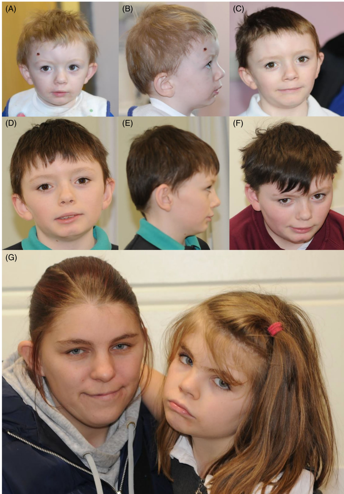
FIGURE 1 Photographs of Patients 1 and 2. Patient 1 at the age of 3 years (A, B), 6 years (C), 9 years (D, E), 13 years (F). Patient 2 aged 10 photographed with her mother (G) demonstrating common facial dysmorphism including prominent forehead, upslanting palpebral fissures and smooth philtrum [Colour figure can be viewed at wileyonlinelibrary.com ]