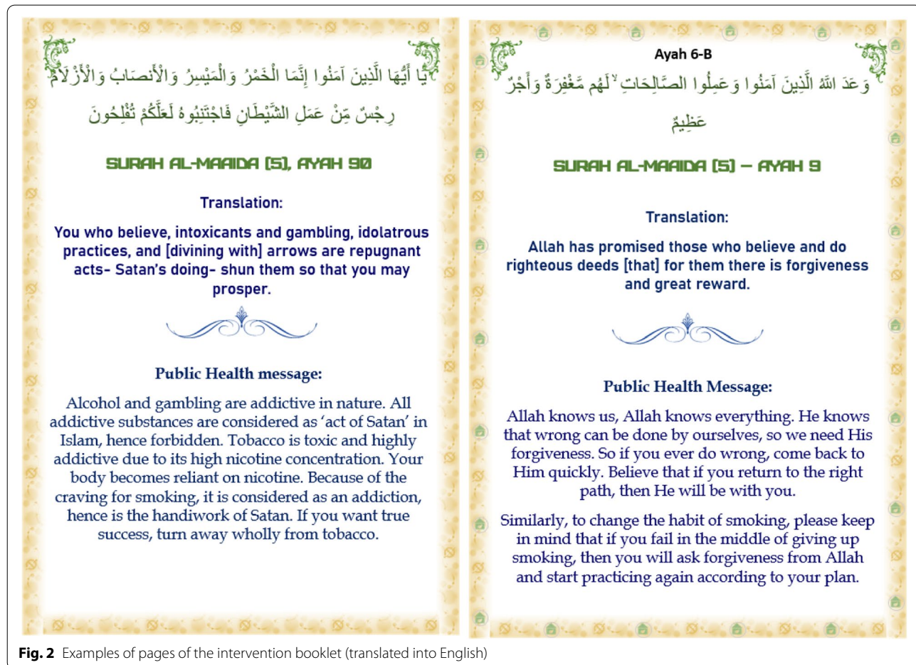
Fig. 2 Examples of pages of the intervention booklet (translated into English)

In accordance with MRC guidance [46], considerable resources were invested to develop an intervention with a conceivable intervention effect on SFHs. This process benefitted from intervention development that had previously been undertaken as part of the UK MCLASS trial [1, 24, 26], as well as intervention development work that preceded this [29]. The four phases undertaken were resource-consuming. However, each phase either directly or indirectly supported the creation or adaption