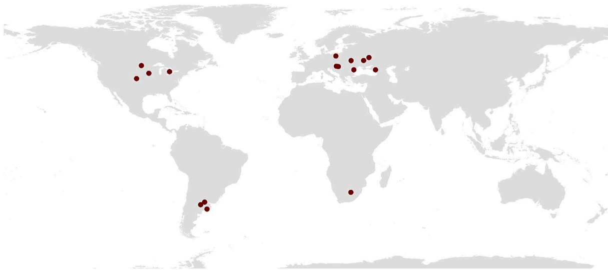
Fig. 1. Locations of 16 farms considered in this study.

these parameters except for the seeding and harvesting dates that were adapted based on local data. 6,7 Furthermore, based on these dates, the crop growth stages were horizontally adjusted using the procedure set out in Henggeler et al. (2020). As advocated by Hoekstra et al. (2011), the irrigation parameters selected in the IS option were irrigate at critical depletion (timing) and refill soil to capacity (application) with a field efficiency of 70%.