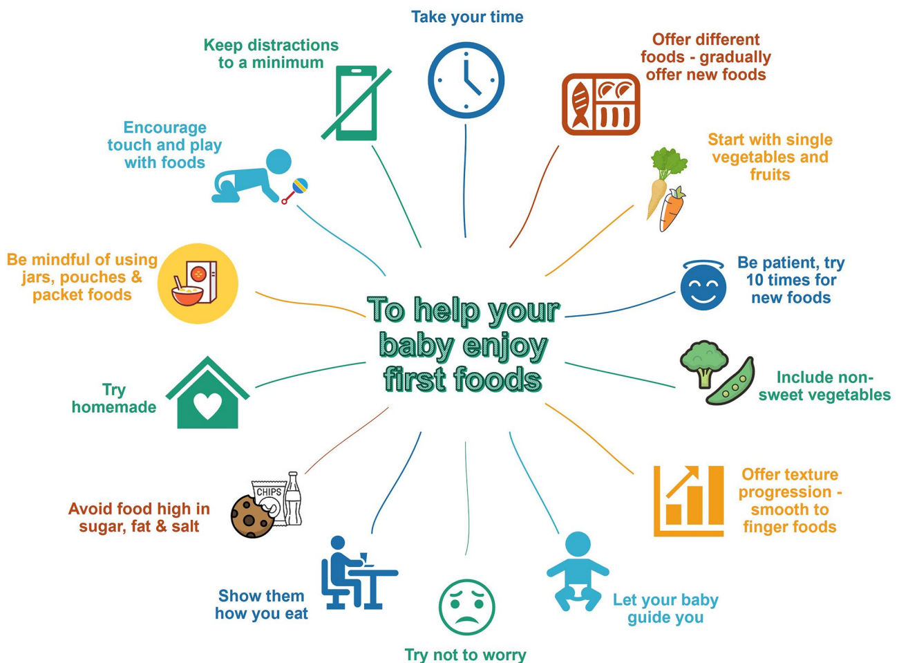
Fig. 2 Graphical summary of the National Health Service (NHS) UK guidance on introducing first foods to babies [14]

To promote dietary health, the World Health Organization recommends intake of at least five servings (400 g) of fruits and vegetables (F&V) per day [18]. However, in Sub-Saharan Africa, intakes fail to reach 200 g per day [19] and it is estimated that 27% of deaths are attributed to low consumption of F&V [20]. Globally, only half (52%) of young children meet the minimum meal frequency and less