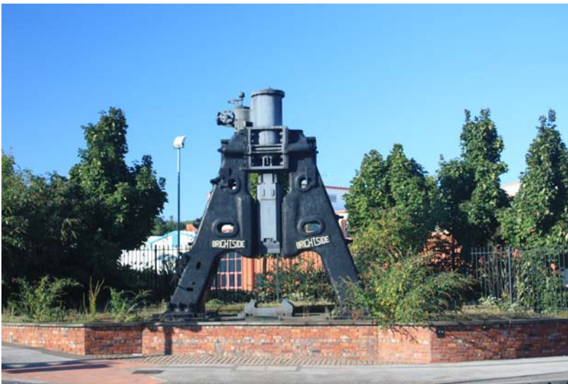
Figure 2. A preserved drop-hammer in the Brightside area of Sheffield. This file is licensed under the Creative Commons Attribution-Share Alike 3.0 Unported license. https://commons.wikimedia.org/wiki/File:Drop_Forging_Hammer_in_Brightside_Sheffield_MG_2185.JPG