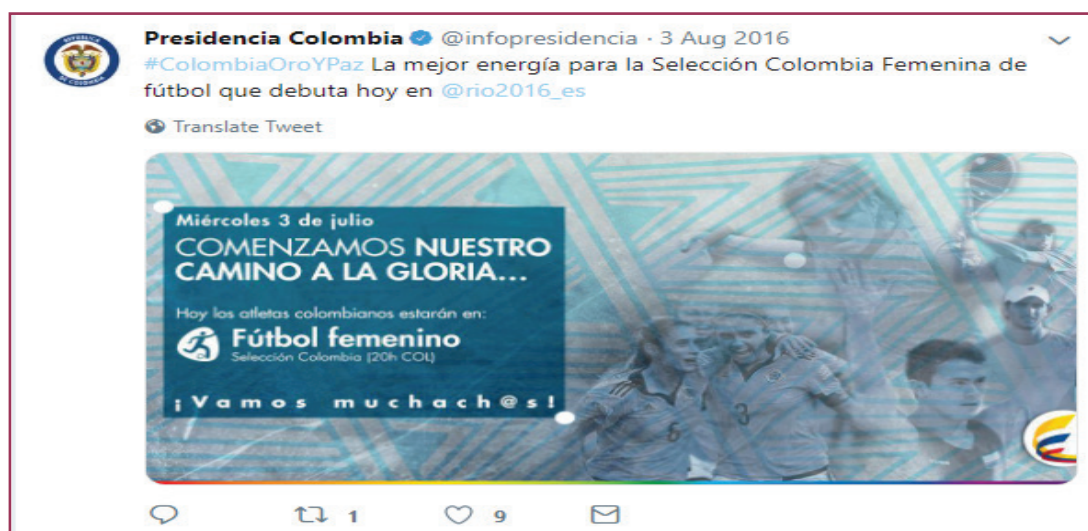
Picture 4 - Colombian women's national football team who debut in Rio2016