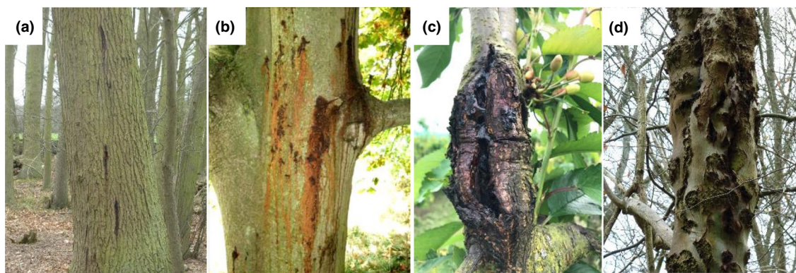
FIGURE 1 Common UK bacterial tree diseases. (a) Acute oak decline (caused by polybacterial consortium, for example, Brenneria goodwinii , Gibbsiella quercinecans , and Rahnella victoriana ); (b) horse chestnut bleeding canker (caused by Pseudomonas syringae pv. aesculi ); (c) cherry canker (caused by Pseudomonas syringae pvs syringae and morsprunorum ); (d) ash bacterial canker (caused by Pseudomonas savastanoi pv. fraxini ). We thank Oliver Booth, Federico Dorati, and Eric Boa for images (a), (b), and (d), respectively [Colour figure can be viewed at wileyonlinelibrary.com ]