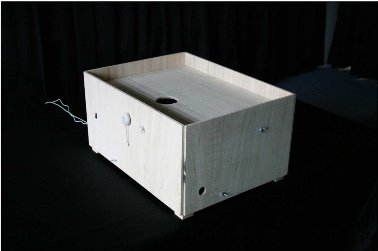
Figure 5. The Ball FUNnel—prototype of a child's toy.

tactic here, discussed in great detail with our participant before construction of the prototype, was essentially to use play with the child as a motivator for engagement. However, the outcome of this choice was that engagement was tied to the sustained interest of the child, and when the child got rapidly bored with the toy, then this motivation, and hence any kind of physical exercise, was ended. This is a case study that suggests some degree of caution when attempting to appropriate the social context into technology design because of the introduction of a dependency on an (essentially unpredictable) individual.