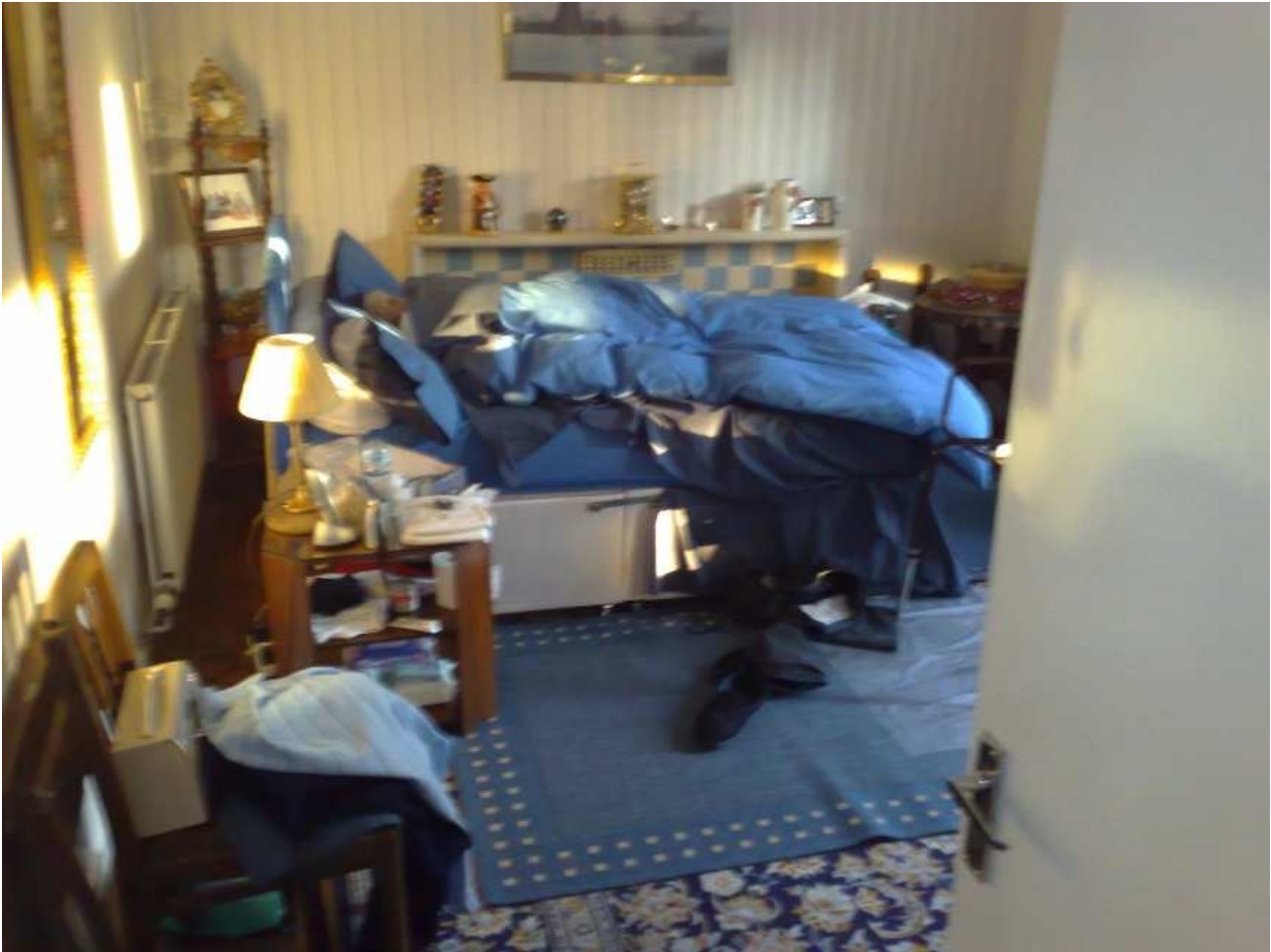
Figure 1. Selected image from photographic sensitizing study.

One implication is that finding a physical space to place digital technologies may be more difficult in the homes of stroke survivors. This does not preclude the integration of technology; we found that participants were often willing to make changes to their homes to incorporate technologies that they believed to have benefits. This suggests that finding an appropriate location is a necessary part of the technology deployment process. It may also implicate work to persuade residents of the benefits of the technology versus the effort of integrating it into their space.