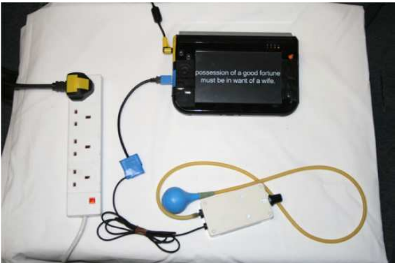
Figure 4. The Rehab Reader.

A prototype was deployed for a period of 7 months, and a total of 6621 grasp and release exercises were conducted during this period. Substantial grasp and release recovery was noted in the hand used to control the device. However, a contention emerged between Irene and her partner about the meaning of the device, and hence how it should be used. Irene saw the prototype as a leisure device, with exercise occurring as a side effect. Her partner saw it as an exercise device, similar in nature to how he