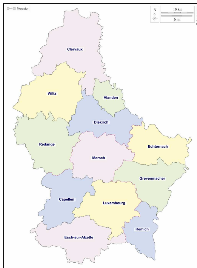
Figure 1 Map of Luxembourg cantons.

where y is unmet need due to wait, distance or affordability and X is a vector of explanatory variables.