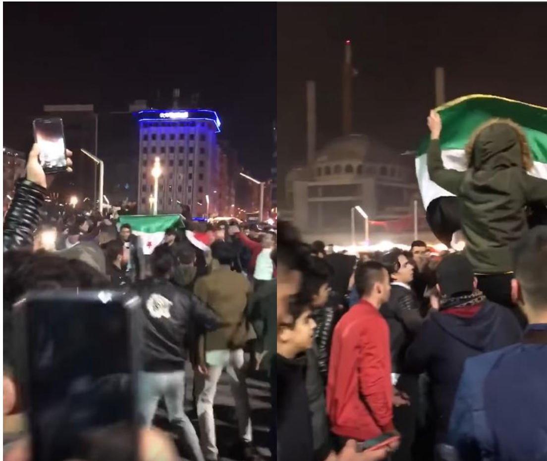
Figures 1 and 2 – Screenshot images from the YouTube video.

community-making on the square (Figures 1 and 2). The shaky point-of-view shot of a chanting crowd of Syrian men, surrounded by concrete buildings creates an aura of hope and entrapment, emancipation and repression at the same time.