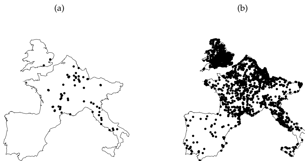
Figure 1: Origins and Destinations of Roman Terra Sigillata

The geographical distribution of production and excavation sites of stamped terra sigillata—on the basis of which we construct our measure of bilateral trade intensity—is depicted in Figure 1. Possibly important factors explaining the varying penetration of different terra sigillata products are taste for variety, variation in quality, and shipping costs. Depending on the available transport modes, the latter could vary greatly, even for two regions located equidistant from a given production site. By employing a gravity-type estimation approach, we isolate the effect of transport costs from other factors and estimate to what extent they influenced interregional trade flows and thus help explain the spatial distribution of archaeological finds.