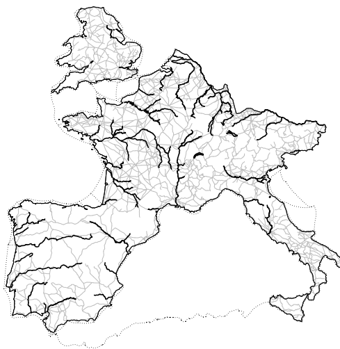
Figure 2: The Multi-Modal Roman Transport Network

Map shows the Roman transport network (restricted to the geographical scope of our analysis). Grey lines symbolise roads, solid black lines navigable river sections, and dashed lines coastal shipping routes.