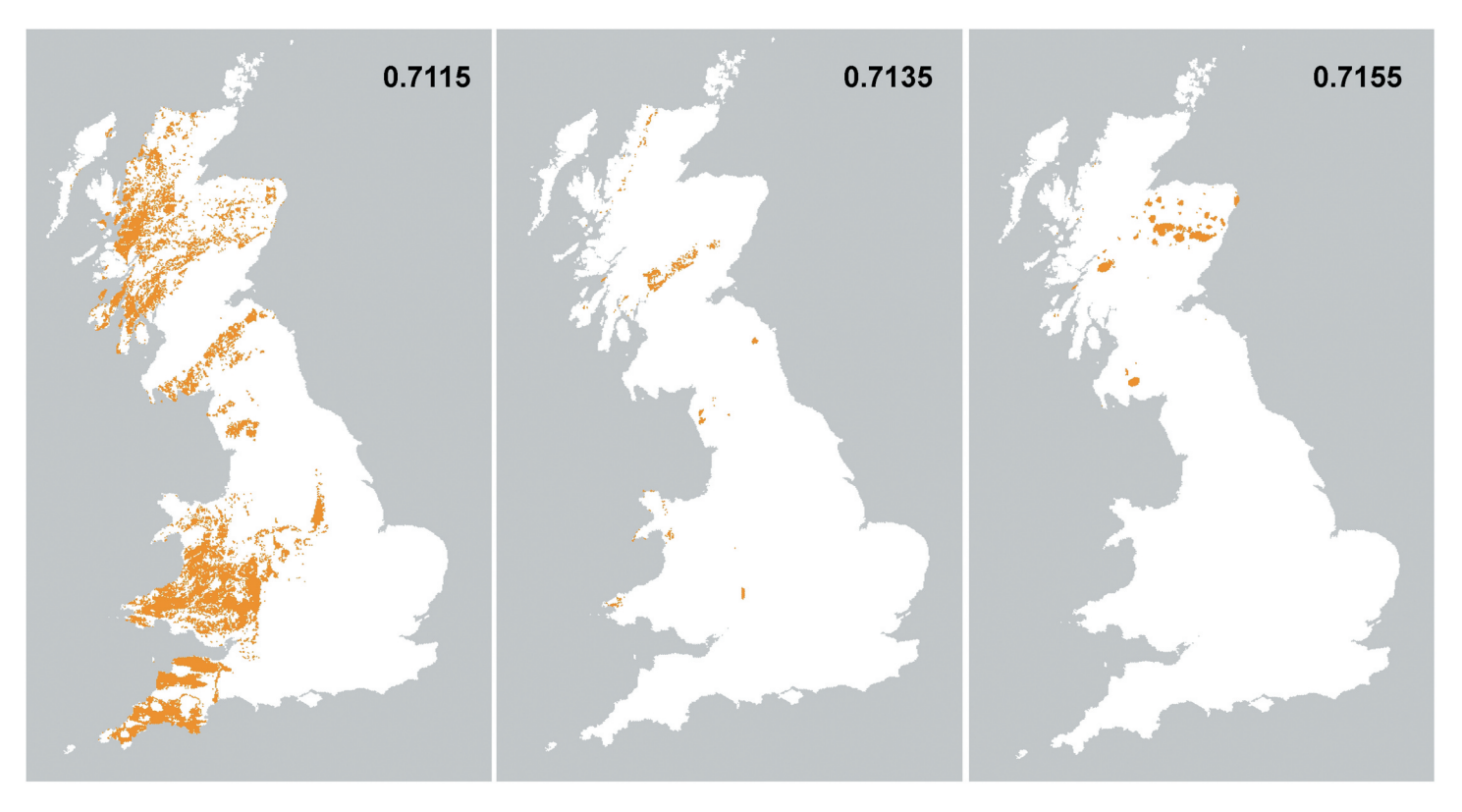
Figure 2. Maps showing areas where domains include values of 0.7115 (left), 0.7135 (middle) and 0.7155 (right), demonstrating how sparse highly radiogenic domains are in the British biosphere based on current mapping (following Evans et al. 2018a). N.B. These maps were not used to pinpoint locations in Madgwick et al. (2019a), but the interactive tool was used to explore the diversity of origins created using BGS Open Access biosphere map https://www.bgs.ac.uk/datasets/biosphere-isotope-domains-gb/.