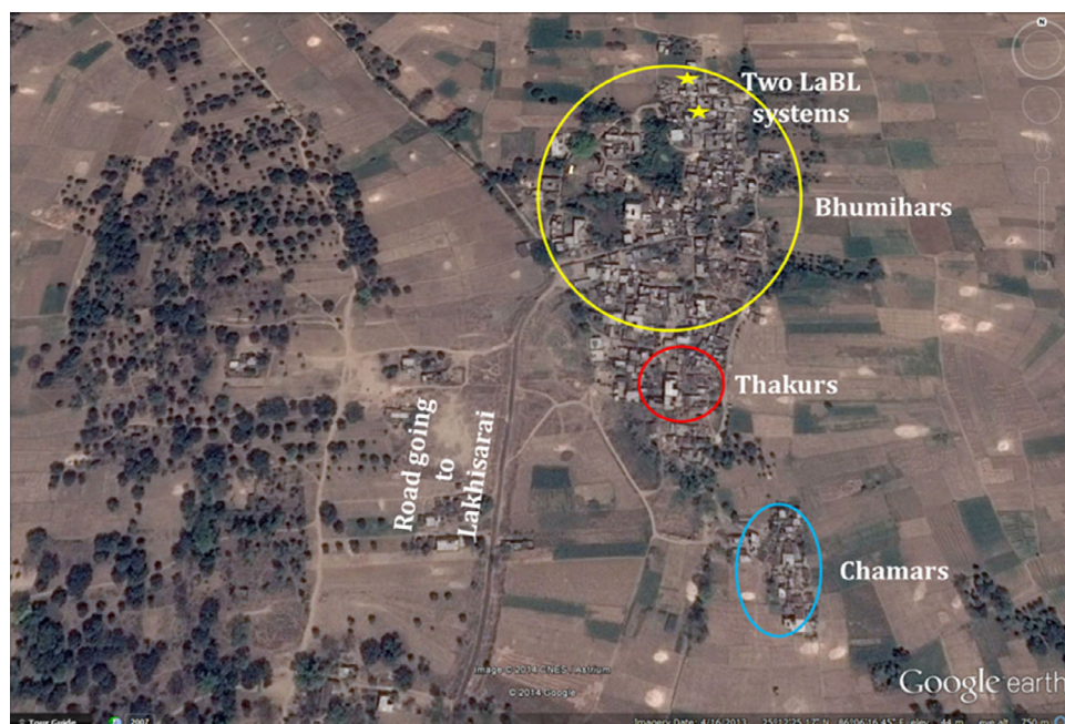
Figure 2: Map of Bijuriya. Bhumihars are higher castes, Thakurs are lower caste and Chamars are Dalits [Colour figure can be viewed at wileyonlinelibrary.com ]

22]. I went one day [to the entrepreneur] and asked why they do not give us 22 anymore when it is in the name of their [points to her children] father. We used to keep it [number 22] responsibly, take care of it. (Women of Bilas Thakur's family, lower caste, Sahariya)