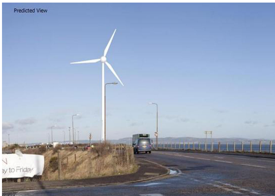
Figure 3: Proposed wind turbine on Portobello seafront. "Predicted view" is the operative phrase, as it was never actually built. [Colour figure can be viewed at wileyonlinelibrary.com ]

As we indicated at the outset, community, when understood in CRE is often seen similarly to what we can find in PEDAL's wind turbine proposal: a community of individuals that "contracts" itself to pursue a renewable energy project. However, by tracing this particular example back to an anti-supermarket protest we can see that the community—the sense of solidarity and togetherness—was forged through active struggle, and only then subsequently put to use. The geographical displacement of the final CRE proposal, far removed from Portobello as