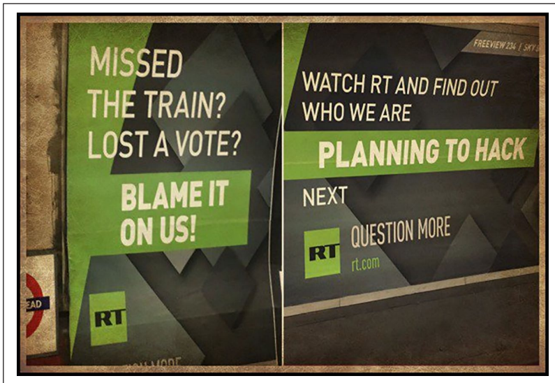
Figure 4. RT advertising campaign on the London underground, October 2017.

it on us!'; 'Watch RT and find out who we are planning to hack next'; 'The CIA calls us a "propaganda machine" – find out what we call the CIA', 'Beware! A "propaganda bullhorn" is advertising here'. Similar advertisements appeared in Washington and New York – enabling RT to respond to British and American criticism in the heart of major Western cities, symbolically laughing at opponents in the face. The adverts were widely