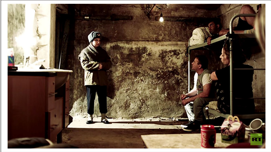
Figure 3. RT Editor-in-Chief keeps foreign nationals imprisoned to use in staged news filming.

it on us!'; 'Watch RT and find out who we are planning to hack next'; 'The CIA calls us a "propaganda machine" – find out what we call the CIA', 'Beware! A "propaganda bullhorn" is advertising here'. Similar advertisements appeared in Washington and New York – enabling RT to respond to British and American criticism in the heart of major Western cities, symbolically laughing at opponents in the face. The adverts were widely