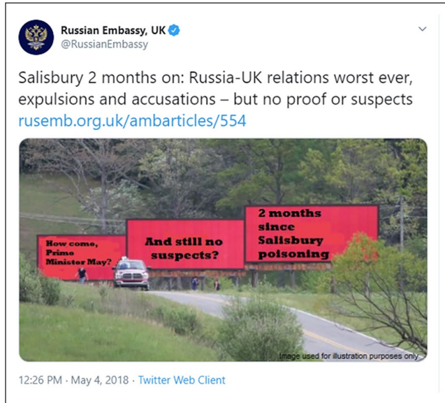
Figure 1. Tweet by the Russian Embassy in the United Kingdom in response to the Salisbury poisoning scandal, 4 May 2018.