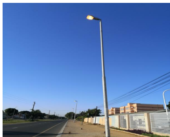
Figure 2: Street lighting switched on in the morning at the National Road 4 (N4)

In key urban and peri-urban areas, residents may engage in electricity theft by bypassing meters or patching into illegal connections (Baptista, 2015). This informal electricity market activity is in part a response to problems of energy affordability for domestic consumers. However, this creates a self-perpetuating cycle of low investment and poor-quality service access. Electricity theft further destabilises electricity connections and reduces EDM's profit, further hindering its capability to maintain a low price-point for consumers. Ordinary urban residents may also build structures such as residential extensions and commercial buildings that require larger power transformers without previously consulting EDM: this threatens to overload transmission and distribution assets, potentially endangering public safety and damaging property. Grid instability is further exacerbated by vandalism and theft of equipment and infrastructure (e.g. theft of electrical cables for producing cooking pans) (Figure 3).