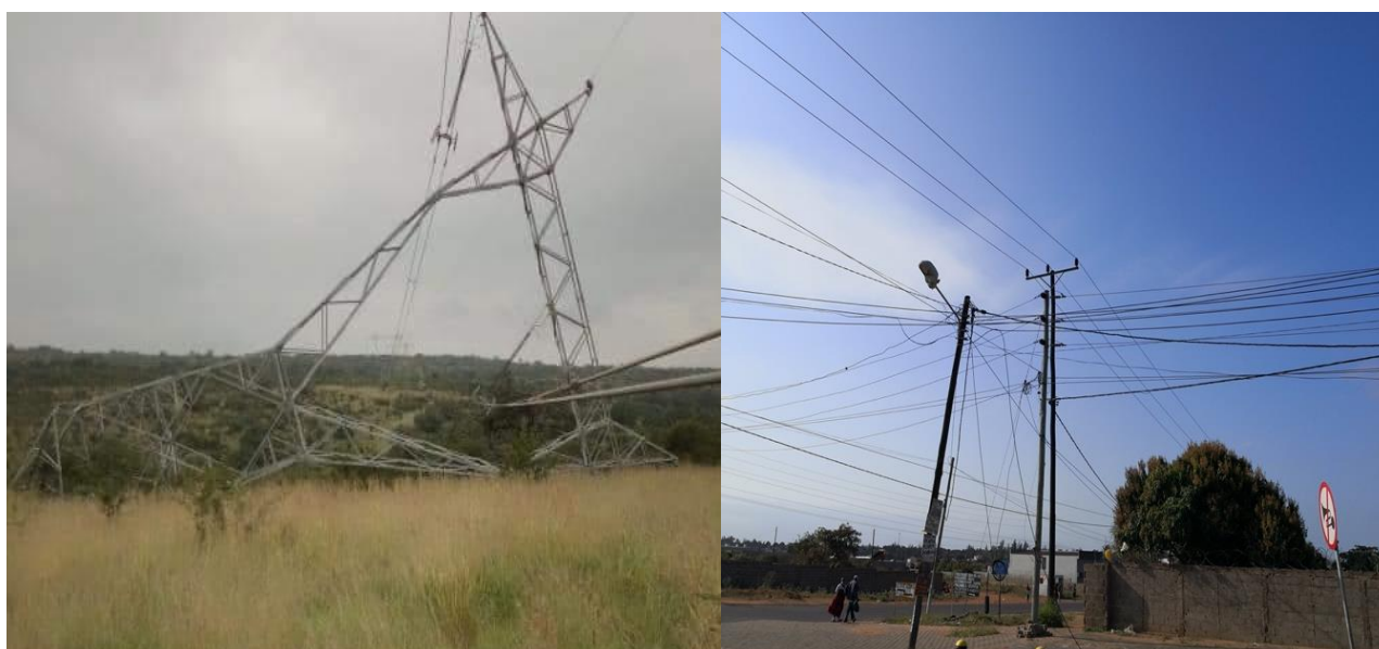
Figure 3: Vandalsed power tower (top) and grid network lacking maintenance (bottom)

On the energy supply-side, capacity deficiencies have exacerbated customer affordability problems. EDM now purchases up to 88% of its total electricity needs from outside sources. Some 36% (2,491MW) of this electricity comes from independent power producers (IPPs) at prices that are three to four times higher than those charged by the state-owned company Cahora Bassa Hydroelectric (US$ 0.036/kWh), which manages the country's largest hydroelectric dam, a key source of generation and export (Sebitosi and de Graça, 2009). EDM spends millions of dollars annually buying electricity from the IPPs (Nhamire et al. , 2019) for US$ 0.09–0.10 per kWh, which it then sells at loss for an average of US$ 0.076 per kWh amid the company's growing operational costs and financial restrictions (EDM, 2020a). The negotiation between state actors and IPPs is fraught with the problem of rent-seeking – the agreed electricity prices bring in state wealth without any reciprocal contribution of productivity (Nhamire et al. , 2019), this results in inefficient pricing