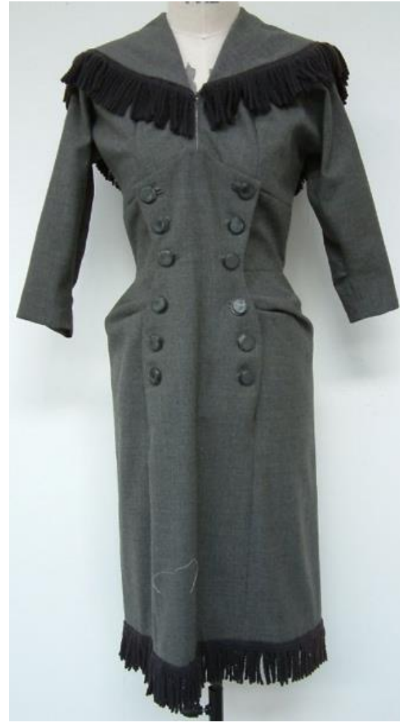
Holland Esq jacket c. 2000, Wool fringe dress c. 1945.