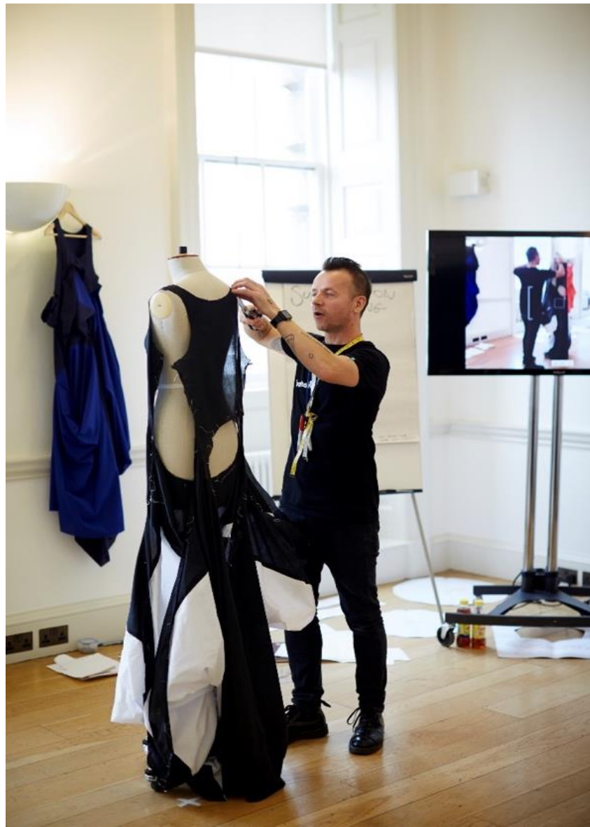
Pattern Cutting Workshop by Julien Roberts.