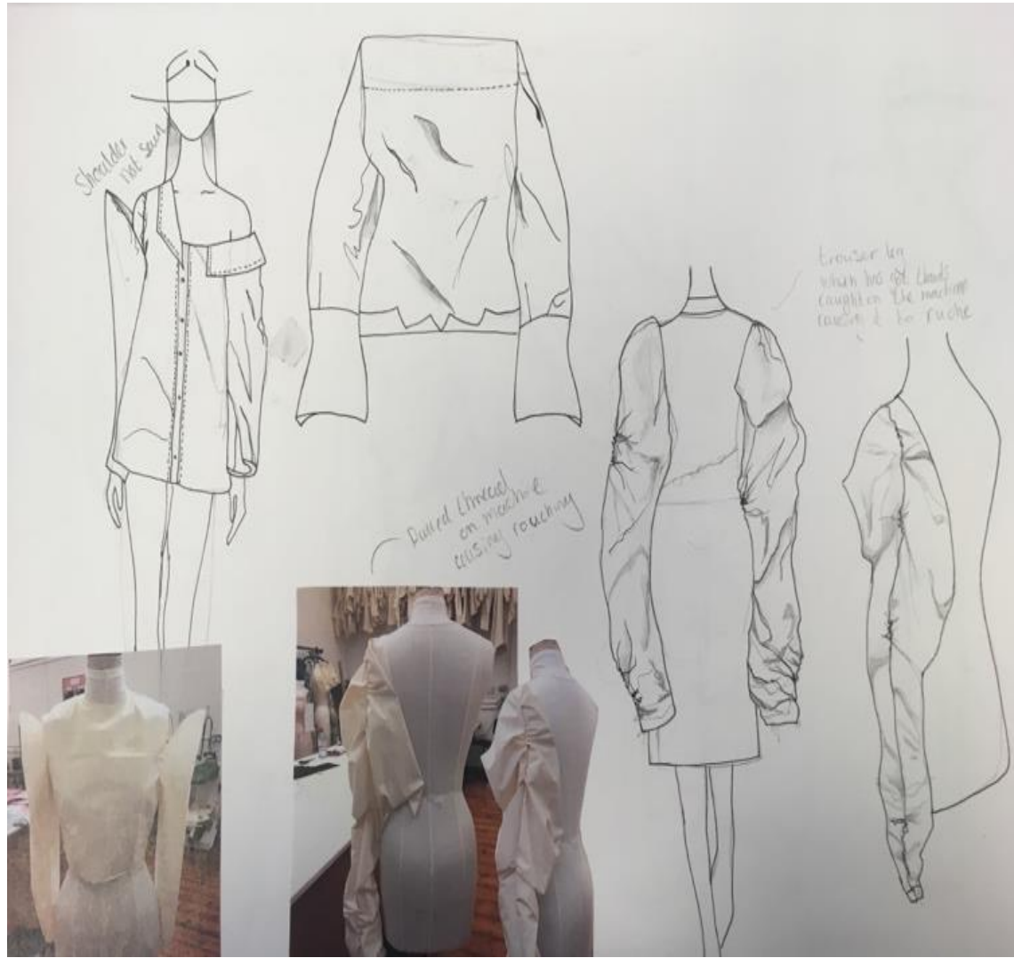
Ideas sketched from stand experiments. Photograph Kevin Almond.