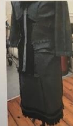
Wool fringe dress c. 1945, photographed inside out.