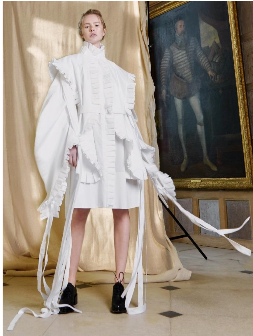
Dress by designer Nabil Nayal inspired by Elizabethan costume from the Elizabethan Sportswear IV (A/W17) collection.