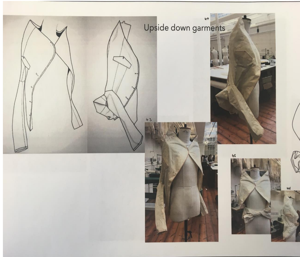
Garments were manipulated on the stand.