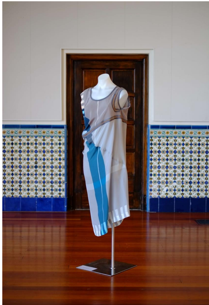
Risky Design Practice - MakeUse zero waste dress by Holly McQuillan.