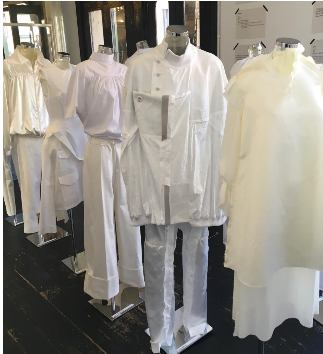
Finished garments from the White Vintage Collection 2018. Photograph Kevin Almond.