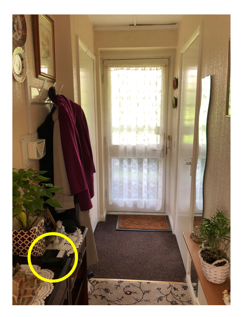
Fig. 1 A walking speed sensor (circled) placed in a participant's home and satisfying both placement criteria

known to be beyond the 'normal' capabilities of all participants and so it could be said with near certainty that these readings either captured the motion of visitors or else were anomalies generated by incomplete traversals or interference from other sources registered by the sensor. Regardless of cause, these outlying readings were removed before analysis. The weekly mean of the daily median walking speed was used to visualise any week-toweek changes in the participant's walking speed. Frequency distributions of speeds for each participant were also generated. Scatter plots and Spearman's rank-order correlation test were used to compare walking speeds measured by the sensor and those calculated from the manually timed walk test.