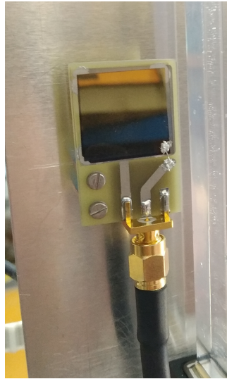
Figure 1. Diamond detector frame and substrate. The board was mounted on the movable part of the VAMOS focal plane. The contact junctions were done using silver epoxy. The total size of the board is 3.45 \times 2.20 \text{ cm}^2 .

A third test was performed with a Cf-202 source once the diamond detector was properly located on the VAMOS focal plane. This test allowed us to ensure that the electronics was working and we also could adjust the threshold in order to avoid noise and get a clean signal of the pulses.