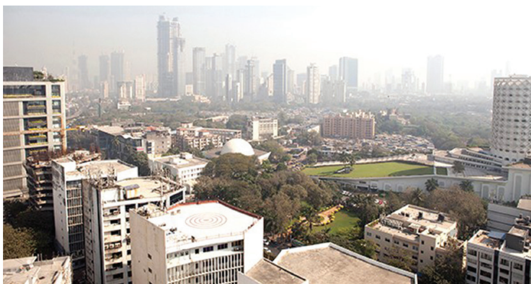
Figure 1: The school environment