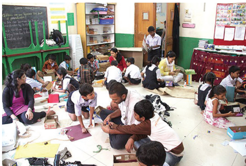
Figure 2: Classroom workshop