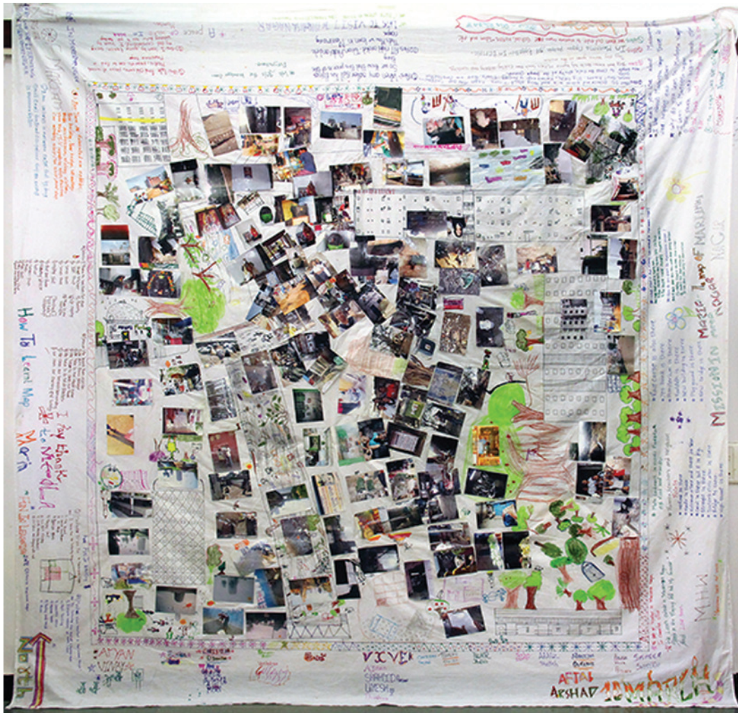
Figure 5: Photomap

Back in the classroom, I had set up a template for the map on a large white cotton sheet, locating simple hand-drawn illustrations of neighbourhood landmarks so that the children could orient themselves on the 'page'. They positioned their printed photographs after many conversations and debates, and they added drawings and annotation to the collaged map (Figure 5). Hart (1997: 163) explains that collective drawing has 'the potential of being a central technique in allowing a group to move towards a unified expression of its desires'. Furthermore, he writes that 'It is most likely that the modelling of places also offers the opportunity for children to deal with emotional conflict by symbolising phenomena and dealing with them through manipulation in a way that is not possible in the everyday world' (Hart, 1987: 224). For instance, in the children's map, the canal became filled with drawings of sweet wrappers, pointing to the vast amount of waste the children saw, representing a Freirian limit situation. As anthropologist Tim Ingold (2013: 125) points out, drawing is 'a way of telling'.