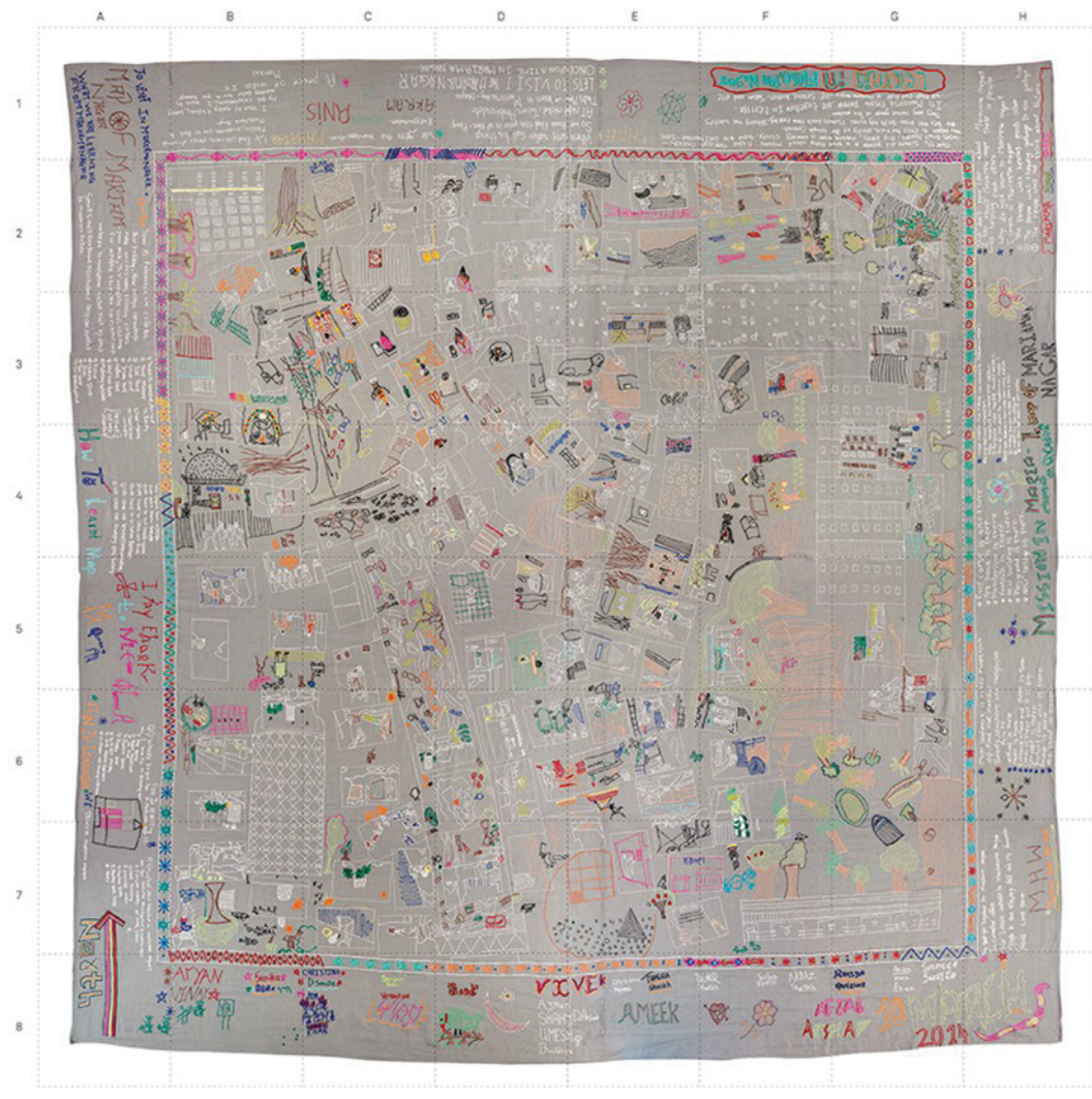
Figure 6: Tapestry

concept design, detailed design, prototype development, collective design, discussion with fabricators, and public presentation. Using drawing as a means of learning, and craft as a local modifier, the neighbourhood provided a place for the children to find and adapt 'limit situations' through what Freire calls conscientização