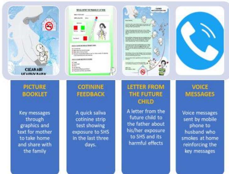
Figure2: IMPRESS Multicomponent Behaviour Change Intervention