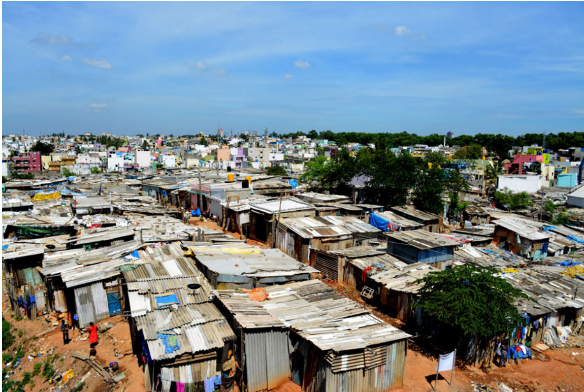
Fig. 1. Aerial View of Devarajeevanahalli (DJ Halli) slum, Bangalore [1].

Though challenging, investigating the seroprevalence of COVID-19 in DJ Halli slum was critical for us to plan the health and social interventions in this slum. Since there is a lack of information regarding the seroprevalence in slums, the study will add to the body of evidence – to help city health officials locally and public health scientists globally.