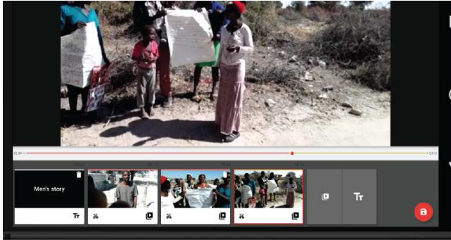
Figure 2: Editing Screen of Our Story Application

engagement, facilitators collect the devices and upload all videos to the platform which captures and stores each video alongside semantic meta data about who, where and what was shot ready for the review process.