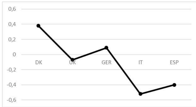
Transnationalism Index (std.) across five EU countries Source: EUCROSS Survey (2012), weighted estimates. N=4,427.