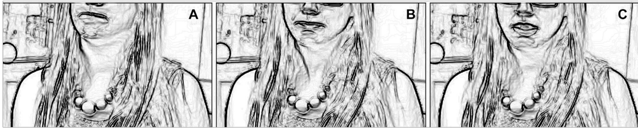
FIGURE 2 | Images of swallowing from Example 5 . The speaker (pictured) says “Belinda got-uhm: ① (0.7 SWALLOW ②) CLICK ③ a ((ei)) (0.6) grant”. (A) : taken at the end of “uhm”. Note the tightly pressed lips with the outer surfaces pressed inwards. (B) : taken during the swallow. Note the visible tendons in the neck as the larynx is raised. (C) : the swallow is released into a click, and the lips are opened.

equal intervals in time between the marked beats: i.e. the beats are isochronous, and this generates a sense of rhythmicity. Rhythmicity in turn generates coherence across the gap, projecting moments in time with which further speech events can be coordinated (cf. Ogden, 2013: 314–316, on clicks used as metronomes with the same function), and tying the talk after the swallow with the talk before it. Interestingly, the swallow is timed in such a way that the return to talk happens on beat with prior talk, so while the swallow disrupts the flow of surrounding talk, it is also fitted to aspects of the production of that talk.