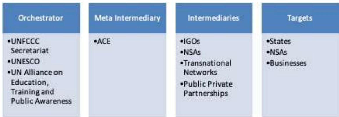
Figure 2. Orchestration of Action for Climate Empowerment.

Further justifying its credentials as an example of orchestration, ACE includes individual commitments and cooperative initiatives, its primary function being Implementation of Article 6 of the Convention and Article 12 of the Paris Agreement (which re-emphasises the importance of the six elements mentioned above). Individual activities encouraged by the meta intermediary (Bäckstrand and Kuyper, 2017) and engaged in by targets include nominating National ACE Focal Points, identifying opportunities for international and cross-sectoral collaboration, and mainstreaming Climate Change Education. Cooperative initiatives include participating in annual ACE Dialogues, creating green jobs and developing public awareness schemes. Soft inducements are used such as public promotion of successes, ACE funding sources and networking opportunities (UNFCCC, no date).