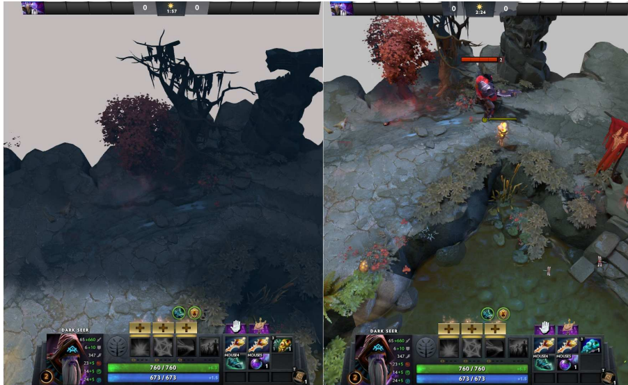
Fig. 1. An unwarded area (left) in Dota 2 vs a warded (right) where the enemy character can be seen because a ward has been placed. The enemy is the larger red unit while the ward that counter-acts fog of war is the smaller yellow object