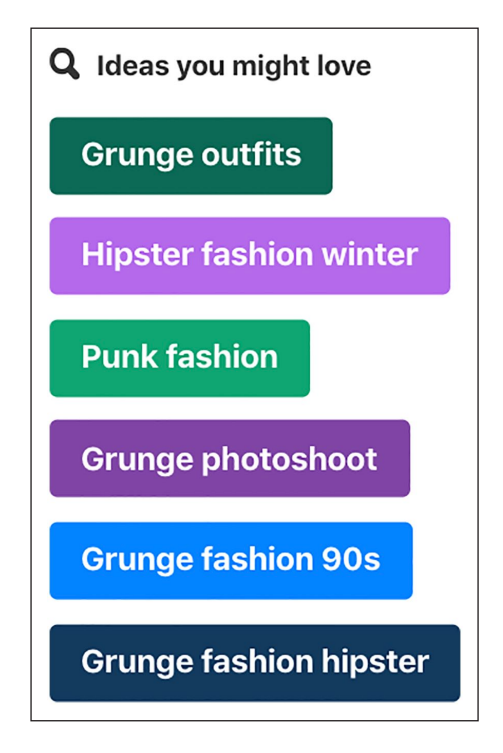
Image 2. Pinterest recommendations following a search for 'bonespo'.

Despite bonespo's clear links to pro-ED discourses, it remained searchable on Pinterest at the time of writing. However, these recommendations alone – and arguably the image itself – are not especially objectionable. They relate to fashion and perhaps classed identities and imply highly stylised gender performances that are consciously intended: something more akin to the notion of self-branding or promotion (Hearn, 2017). What matters here is what prompted the recommendations: a keyword search explicitly related to the promotion of eating disorders. The seemingly mundane process of searching for an image and receiving suggestions for more images users might like reveals a connection between eating disorders, the performatively feminine body and fashion/consumerism. As Dias (2003) notes, and mirrored in the search results discussed above, 'the assumption, evident in most popular notions about eating disorders, is that these women are conforming to dominant notions of femininity' (p. 37). They also conform to dominant notions of white femininity, as grunge subcultures in particular have their roots in 'white youth in the US suburbs' (Huq, 2006: 139). Furthermore, this finding highlights the importance of the 'also liked' algorithm we discuss later in the article.