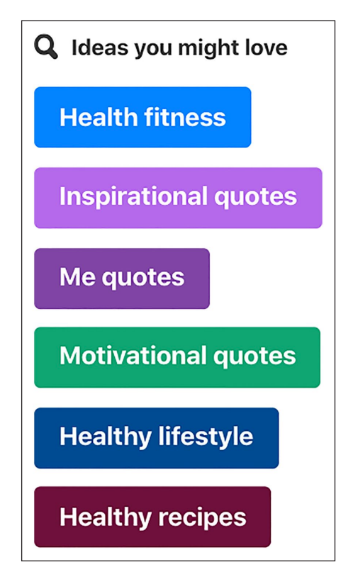
Image 5. Pinterest recommendations following a search for 'proanaa'.

At first glance, these recommendations are not explicitly linked to identity markers such as gender, race or age. But when combined – indeed, assembled – with both discursive and statistic knowledge of eating disorders indirectly tells us that they are experienced as feminine, white and youthful in multiple ways. Pinterest's recommendations thus add to a broader social imagination and stereotyping of eating disorders not only as a white women's issue but also as a neoliberal, postfeminist preoccupation with body improvement and performances of 'successful' femininity: understanding that femininity is a bodily property, that a woman must possess the right body in line with the current hegemonic ideals, that the body must be adequately disciplined and surveilled, and that a woman's 'goals' can be successfully achieved through a makeover (Gill, 2007). The 'sexist' element of the assemblage(s) is bound up in the social and cultural inferences that are both evidenced in the content itself, and through the content in terms of what the search algorithms suggest over time. To re-iterate, this is not to say that these elements are static or will not change but rather that we begin to get a sense of processes and logics that we need to investigate further.