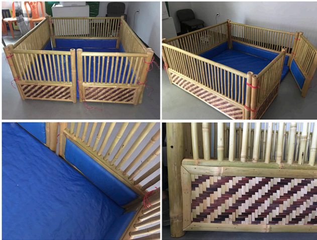
FIGURE 3. Final playspace prototype design for the Campylobacter -Associated Malnutrition Playspace Intervention trial feasibility trial. This figure appears in color at www.ajtmh.org .