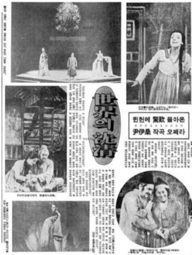
Figure 5: “Simch’ŏng in the World,” Kyŏngnyang Sinmun, August 9, 1972.

From 1971 to 1974, Yun’s music appeared in at least eleven concerts in South Korea, suggesting that the state did not raise objection to public performances of his music (see Figure 3). Particularly notable were two new music festivals held in 1971. The first of these, a festival organized by the conservative Music Association of Korea, performed Yun’s Loyang, which used a type of Korean court music that drew on Tang-dynasty Chinese music as source material. 43 The second of these programmed not only Yun’s music but also that of his South Korean students who had recently returned from Hanover, Paik Byung-dong and Kang Sukhi. 44 Park and Kang subsequently became leading figures in South Korea’s experimental music scene. In this way, Yun shaped the course of new music in his native country from