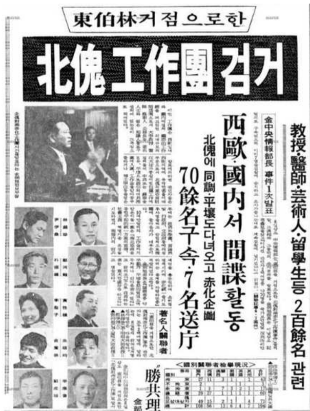
Figure 4: "Arrest of North Korea's East Berlin communist espionage operation," Kyŏngnyang Sinmun , July 8, 1967. Yun Isang's photograph is top left among the ten photographed figures.

More sympathetic reports also began to appear in early December of 1967, a few weeks before the first trial. Such reports were a response to the increasing international attention that the case of Yun and the broader scandal were attracting. 28 Nevertheless, an awareness of increased international attention among domestic journalists did not mean they could freely introduce foreign coverage surrounding Yun and the East Berlin Affair. At this time, journalists could pay dearly if their reports on world affairs did not conform to the state's position on North Korea. For example, in 1964, the KCIA jailed the well-known reporter Rhee Yŏngghi for reporting the United Nations' consideration of granting admission to both