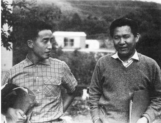
Figure 1: Paik Nam June (left) and Yun Isang in Darmstadt, 1958.

composer Ichiyanagi Toshi, and the Chinese American composer Chou Wen-Chung. 11