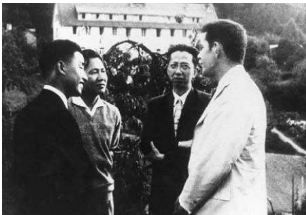
Figure 2: from left, Paik Nam June, Yun Isang, Nomura Yoshio, and John Cage. Darmstadt, 1958.

After 1958, Yun's works were selected to premiere at prestigious festivals - Music for Seven Instruments in Darmstadt (1959), Five Pieces for Piano in Bilkoven (1959), and String Quartet No. 3 in Cologne (1960). In 1962, the Berlin Radio Symphony Orchestra premiered Bara , a piece that alluded to a Korean Buddhist ceremony. Each of these successes delayed his plan to return to Seoul. A Ford Foundation grant in 1964 enabled him to bring his family from South Korea, making his move to West Germany permanent.