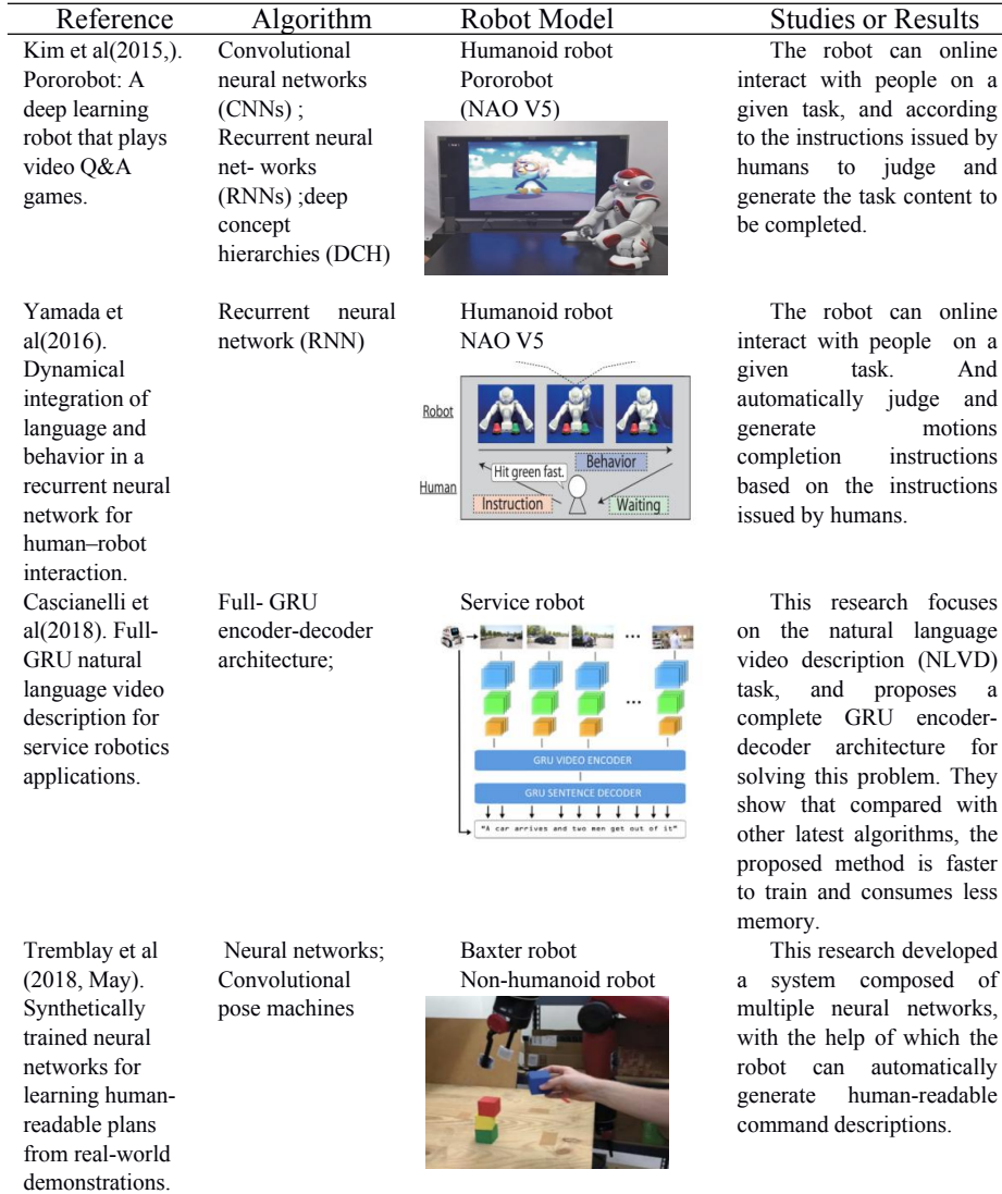
Table 1. Neuro image caption Structural algorithm drive robots

generation. The existing technology is sufficient to help HSRs cope with the simple interactive tasks of the service industry and pave the way of the evolution from HRI to robot companion.