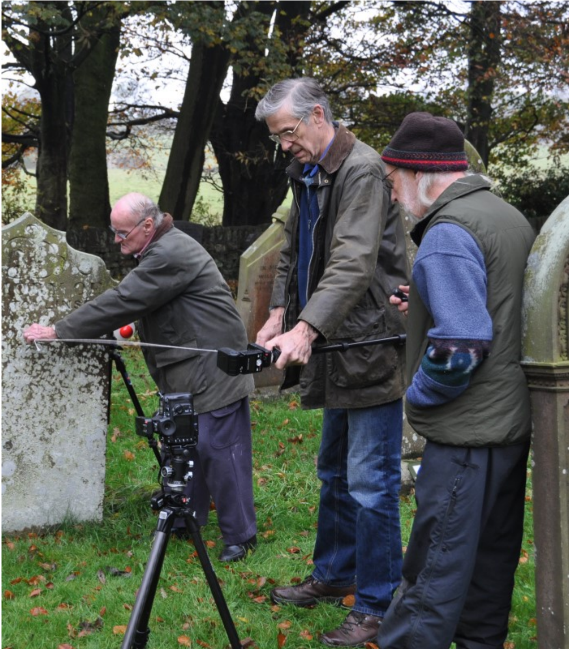
6 - Members of the Embsay with Eastby Historical Research Group conduct a survey