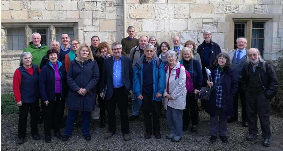
1 - Community participants gather in York at the start of the project