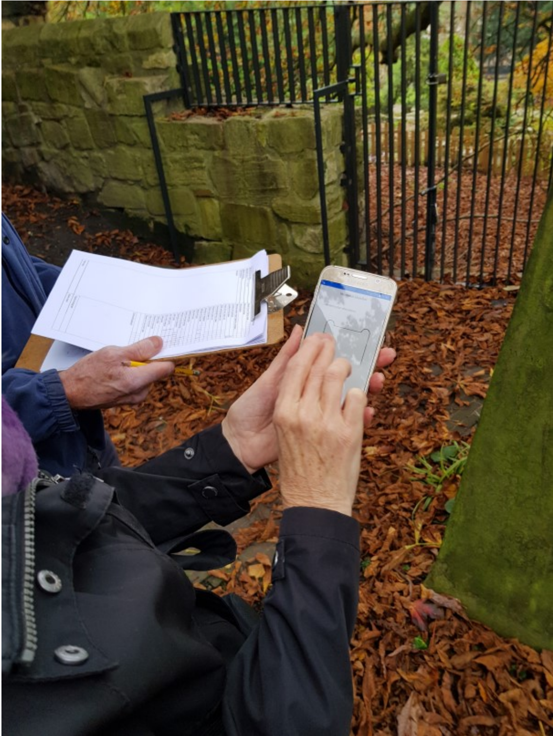
3 - Testing the prototype mobile application